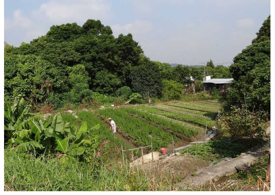
Figure 2. Traditional farming in the New Territories

Figure 1. An active, small-scale farm in the New Territories